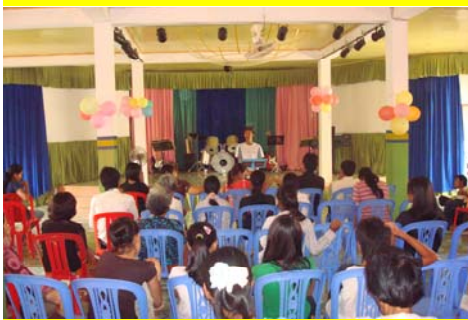
Students sharing testimony in the church service with AOG Church