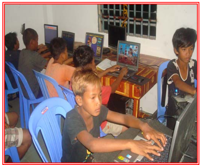
Students are learning Computer