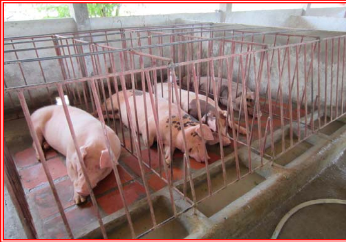
Sows are ready to give birth