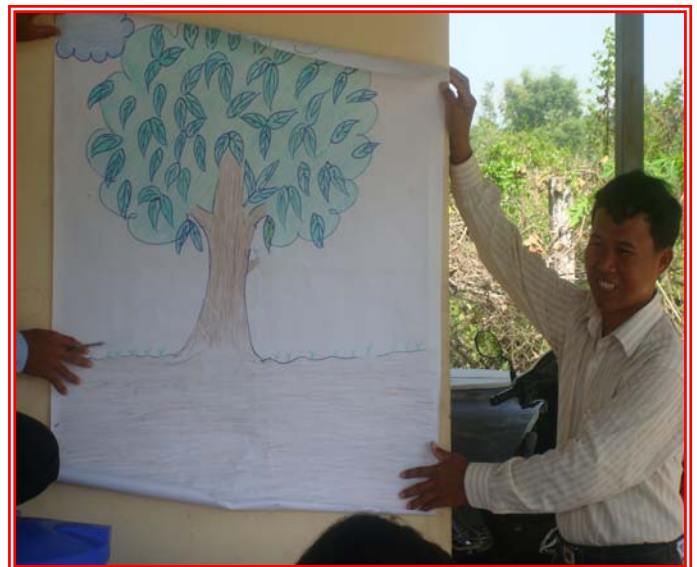
Staff Training on counseling