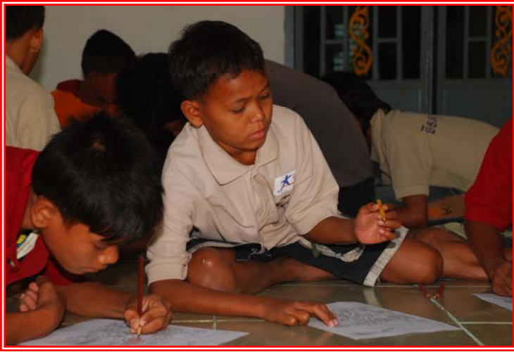
Children participated in art activities