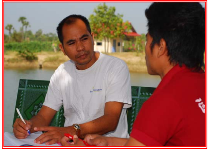
Individual counseling meeting