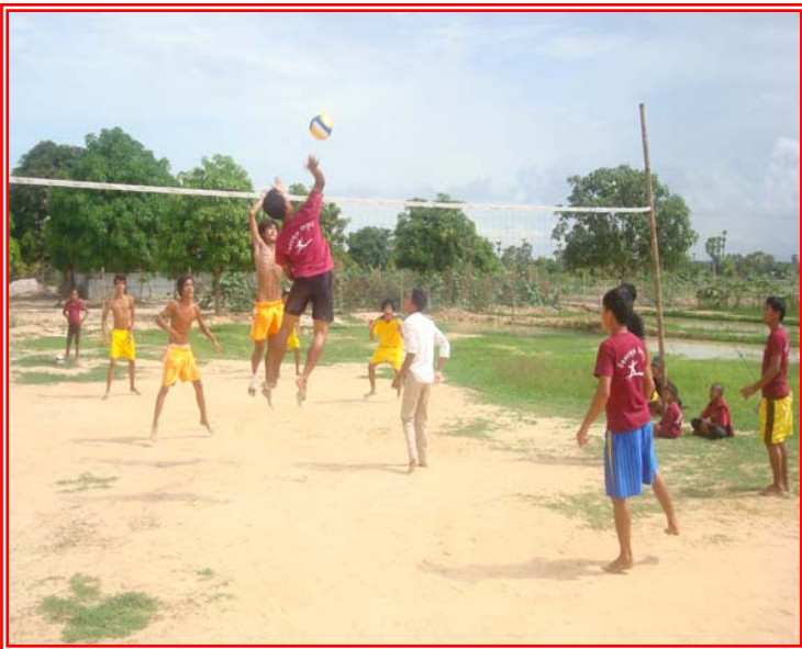
Volleyball contest with other network partner (TASK)