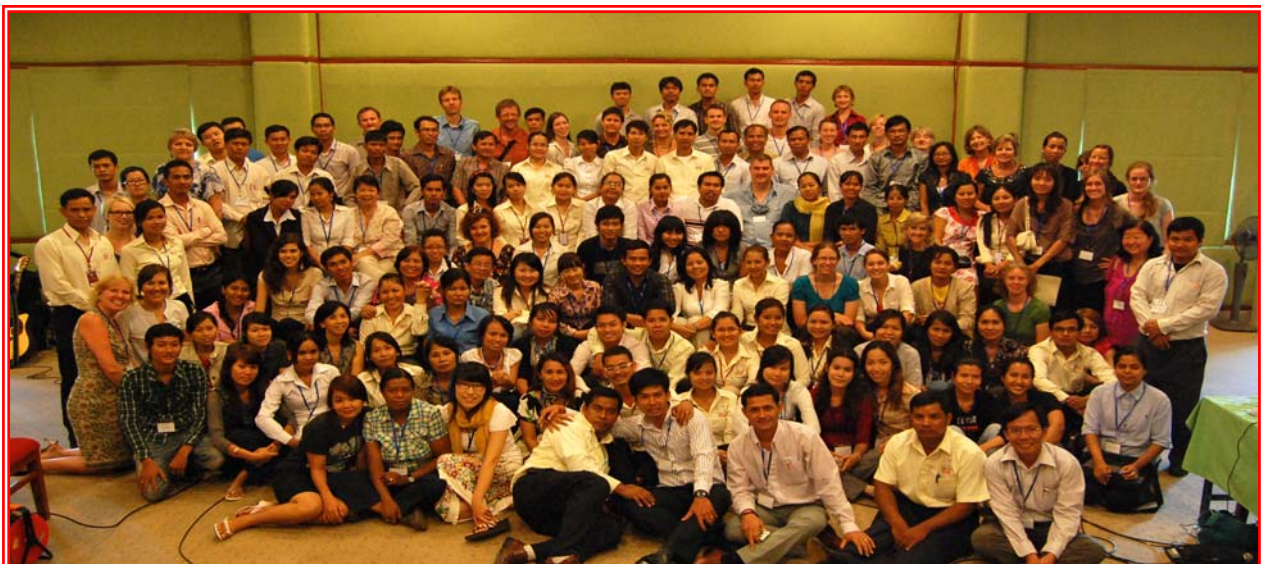
Attending Chab Dai Coalition Members Meeting