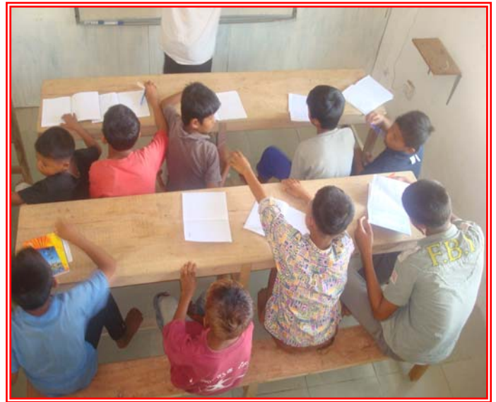
Students are learning Khmer literature