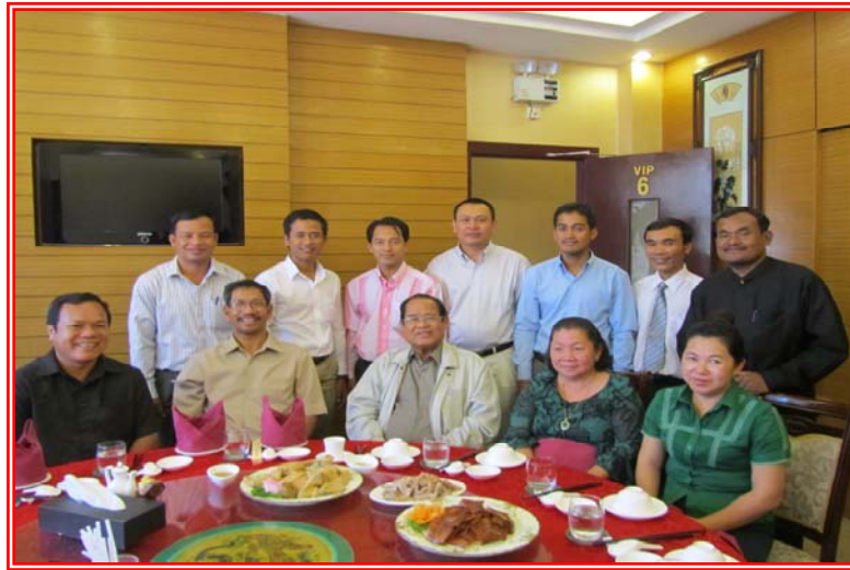
OCC Board Members meet with Minister of Ministry of Religion, Royal Government of Cambodia