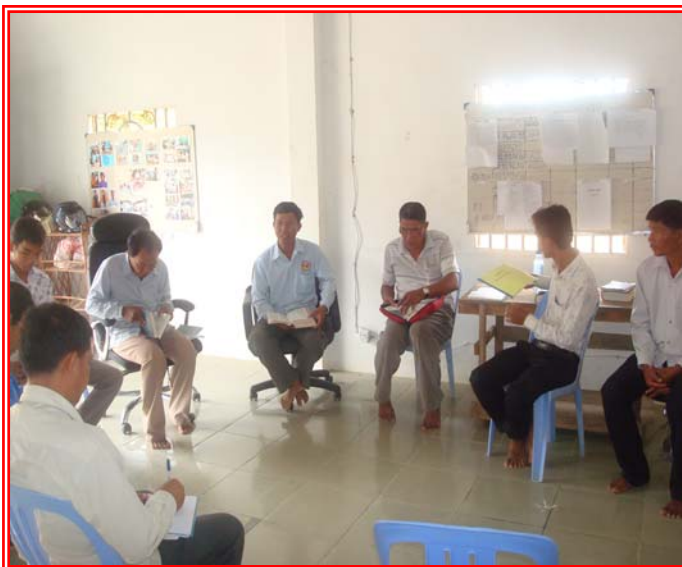
Team building training