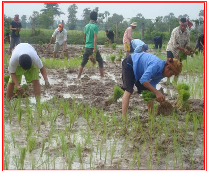
Staff and Students planted rice crops in the field