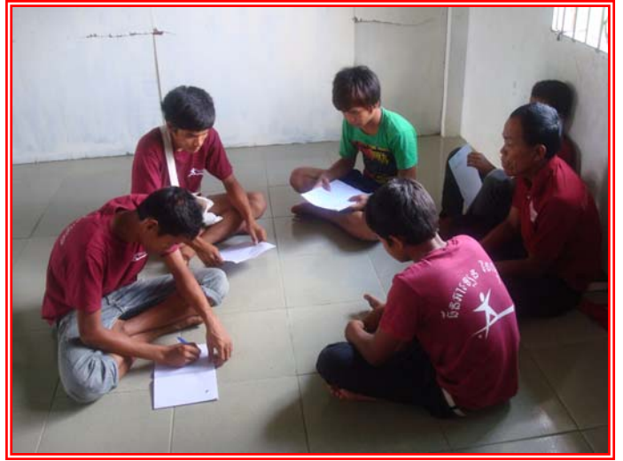
GSNC Group Discussion