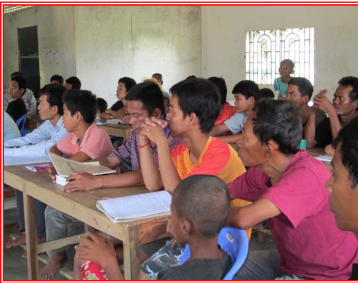
Students are learning English language