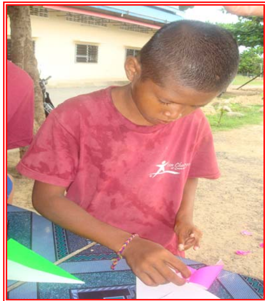
Child is making artificial paper bird