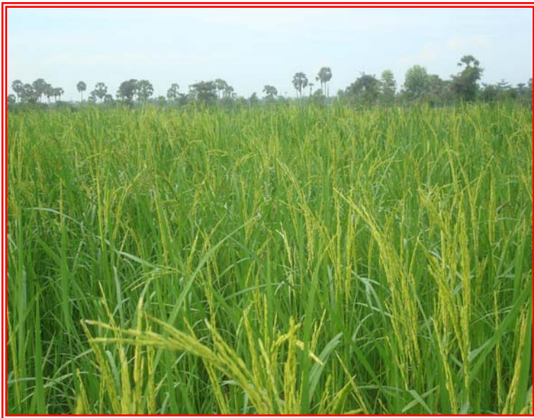
Rice plantation at the Teen Challenge Center