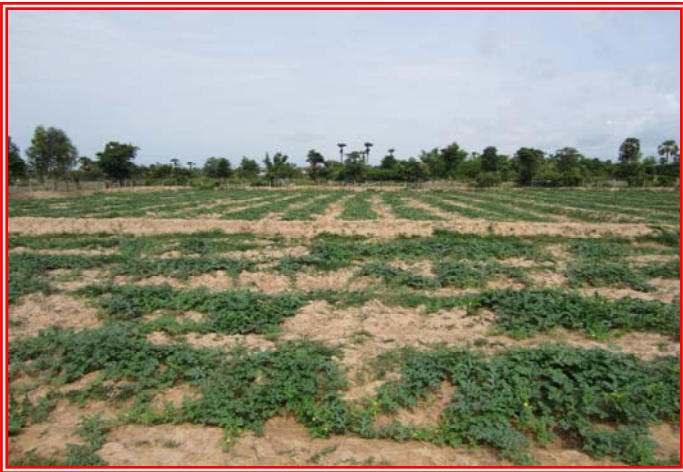
Water melon field