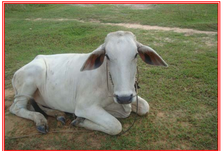
Cow is ready to give birth to a calf