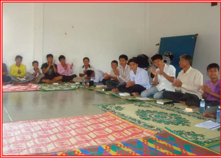
All students attended monthly network meeting