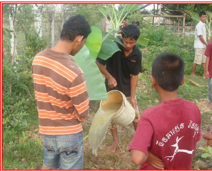
Students are participating in agricultural planting