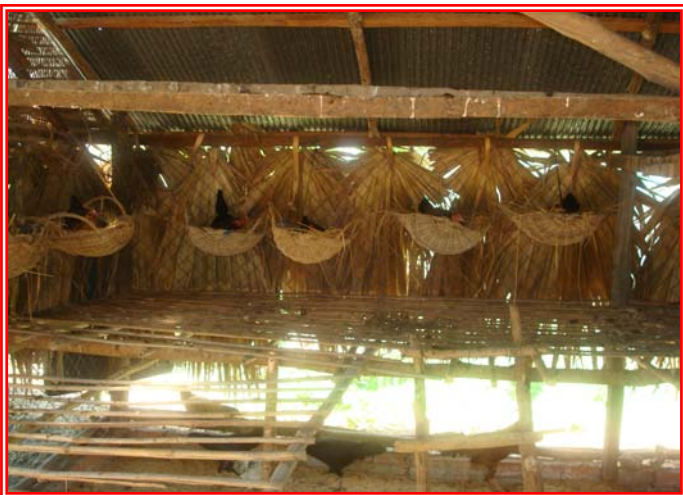
Chicken laid eggs