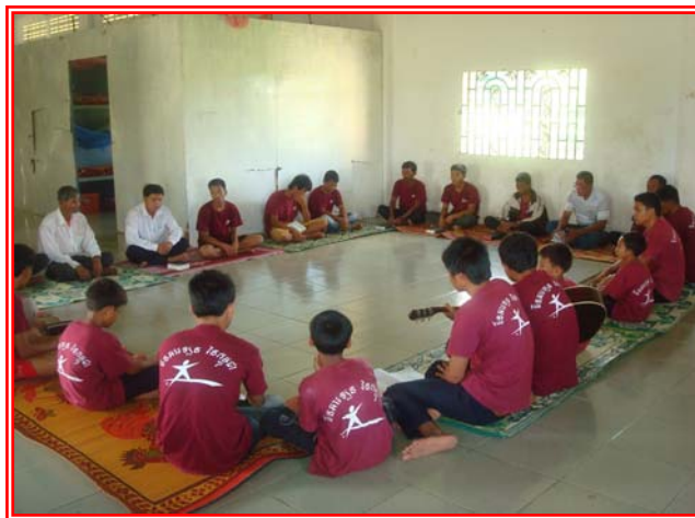
Group Study on Character development