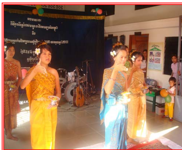
Blessing Dance During Christmas Celebration