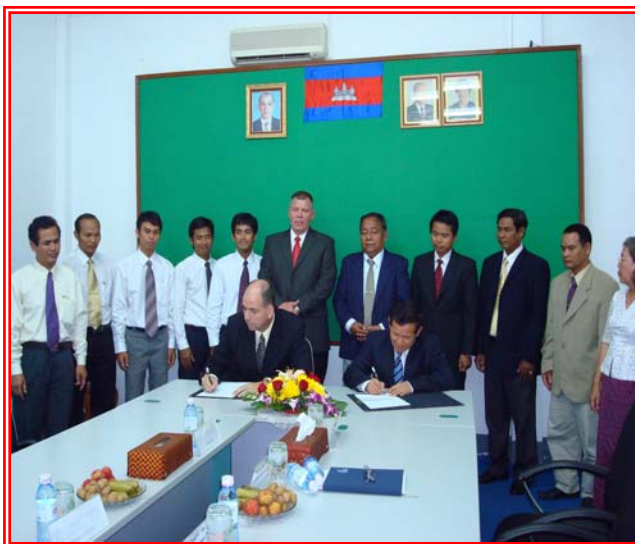
MOU Signed with Ministry of Social Affair