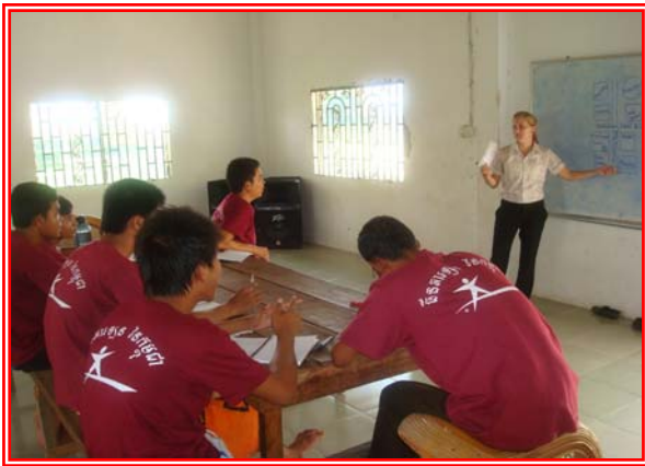
Students are learning English language