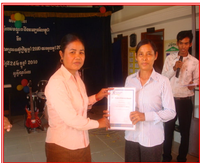
Staff received service award from the Vice District Governor