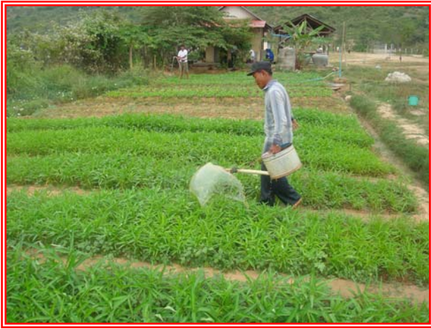
Student is watering morning glory plant