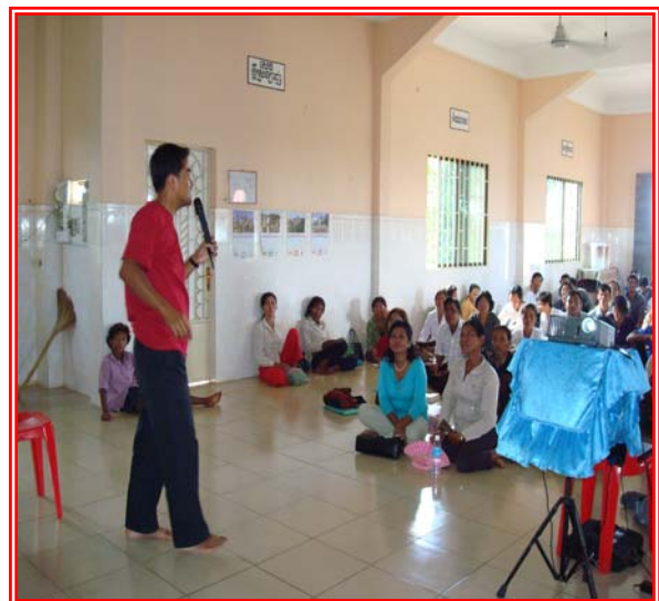
Serving as committee with Operation Christmas Child