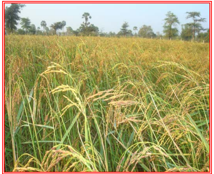
Rice paddy is ready to be harvested