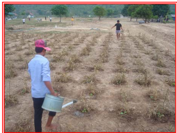
Students are participating in agricultural planting