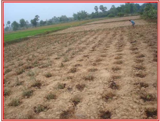
Planting of egg plants and tomatoes