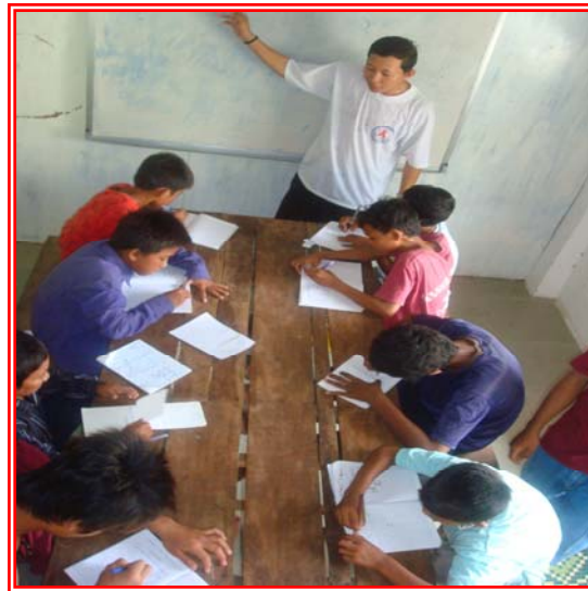
Students are learning Khmer literature