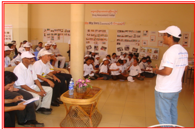
Campaign on International Against Drug