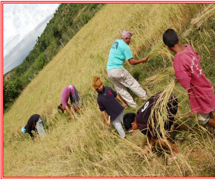
Students are harvesting rice