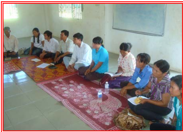
Monthly Network Prayer Meeting