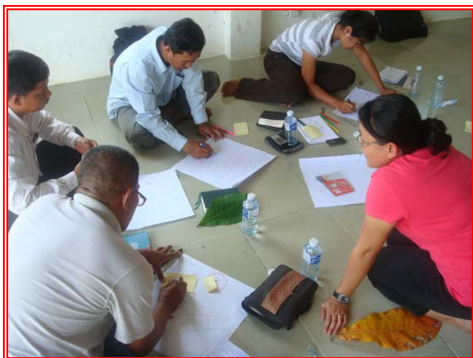
Staff are participating in counseling training