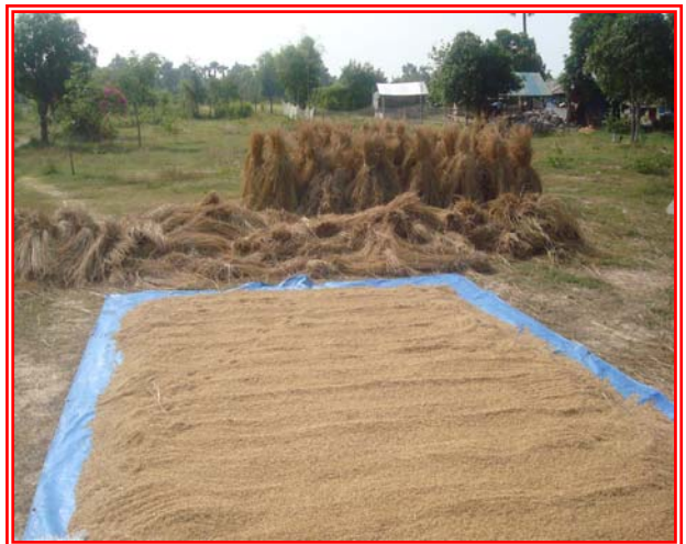
Rice crops at the Teen Challenge