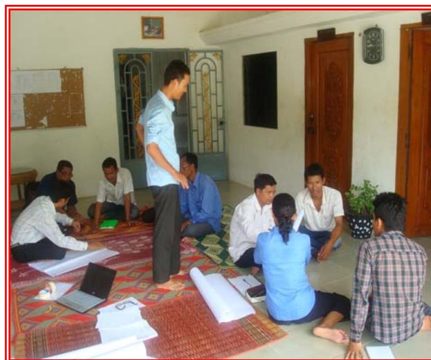
Staff are participating in team building