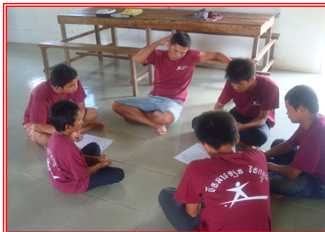
Therapy Accountable Group Meeting