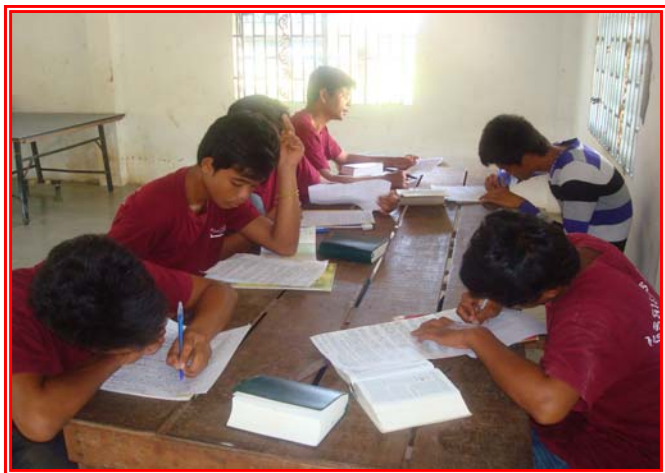
Working on personal class exam