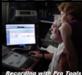
Recording with Pro Tools